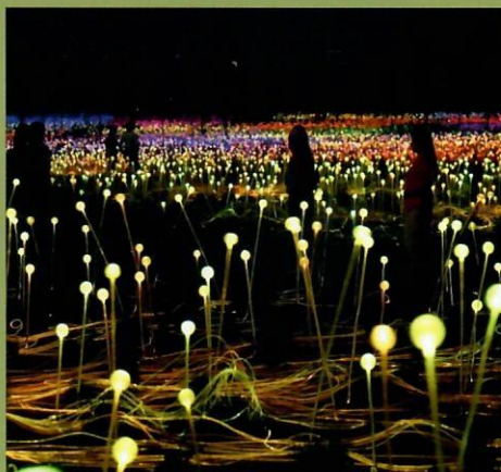
Field of Light